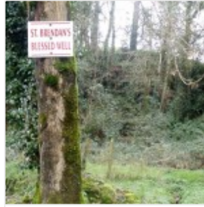
St Brendan's Well