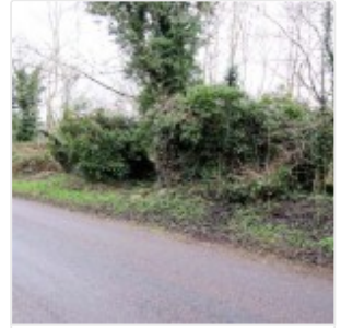
Old Toll House

Website Privacy Policy Financial Statements