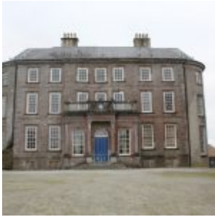
Ballybeg Priory and Columbarium

( https://blackwaterwalkingtrails.ie/buttevant-steeple-to-steeple/doneraile-park-house/ )