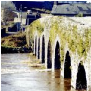
Doneraile Wildlife Park

( https://blackwaterwalkingtrails.ie/buttevant-steeple-to-steeple/buttevant-bridge/ )