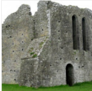
Ballybeg Priory and Columbarium