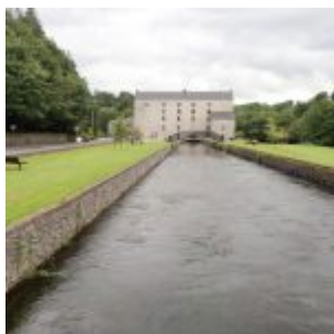
St Mary's Church

( https://blackwaterwalkingtrails.ie/annesgrove-gardens-loop/castletownroche-mill/ )