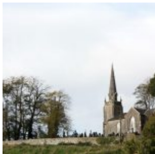
Anne's Grove Gardens

( https://blackwaterwalkingtrails.ie/annesgrove-gardens-loop/castletownroche-cemetery/ )