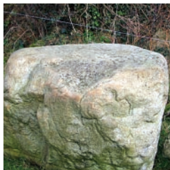
Cloch na gCeann

beyond, Knockanaffrin. Coumduala can be made out to the left of the forestry. The high point above is Knockanaffrin itself, and, hidden below to the right, Lough Mohra. After about 1.5 kilometres the road starts to meander along the banks of the Clodiagh. Enjoy this serene place. Pick up the sights, sounds and smells of nature. The heron is a regular visitor along the river here. Pass off the turn for Graigavalla on your left and continue on to Graigavalla Bridge.