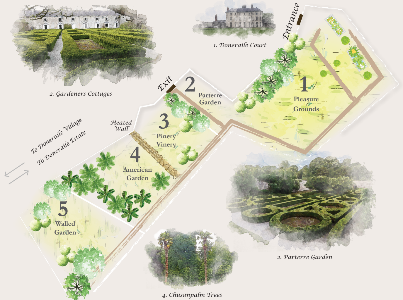
2. Parterre Garden