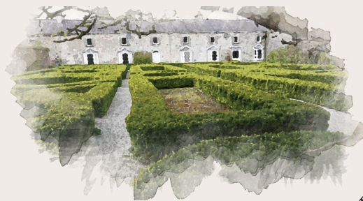
2. Gardener's Cottages

The pleasure grounds as we see it today, would have been laid out in the nineteenth century and would have included 6 large mixed borders of ornamental planting along with 8 cubes of Evergreen Quincox's, five hedging plants grown to form a large cube. This would have been a private area for the owners to spend their leisure time and host parties. The walls of the orangery are still standing and would have been used to grow some of the award winning flowers that were associated with Lady Castletown.