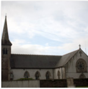
Church of the Immaculate Conception

Website Privacy Policy Financial Statements